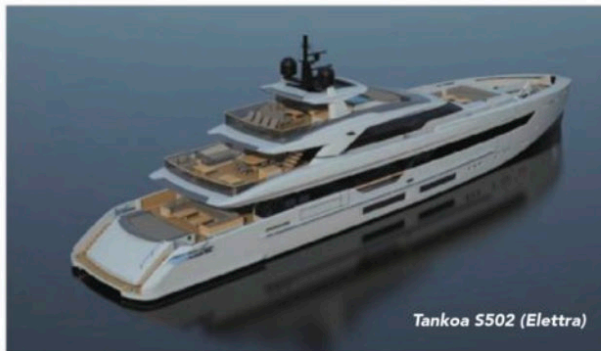
Tankoa S502 (Elettra)

ITALIAN SHIPYARD TANKOA has started building two 50m, all-aluminium sister ships to its S501 project 'on speculation' in La Spezia, with both scheduled for delivery ahead of the 2020 summer season.