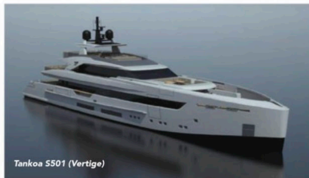
Tankoa S501 (Vertige)